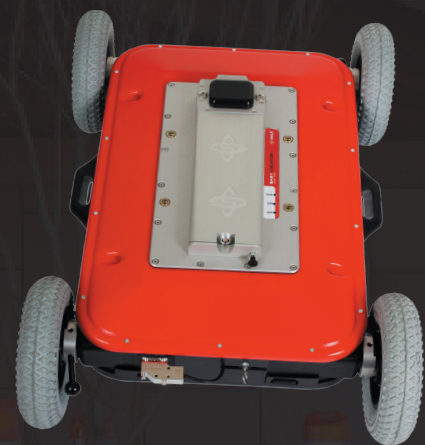
MALÅ EasyLocator HDR Antenna and Controller