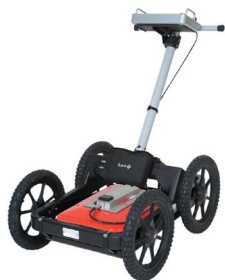
The MALÅ Easy Locator HDR fits also nicely into the MALÅ Rough Terrain Cart (RTC) option.

For more information, see www.malags.com