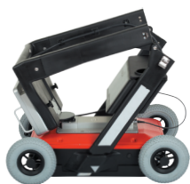
The MALÅ Easy Locator HDR's hinged shaft simplifies logistics between sites and minimizes startup time

The MALÅ Easy Locator HDR is an all-in-one unit with a hinged shaft enabling the entire unit to fit in the back of a standard station wagon for transportation between sites. The (HDR) high dynamic range antenna, optimized for utility detection , are ruggedized, sealed and shielded. The Easy Locator monitor has excellent readability, even in direct sunlight, and the keyboard-less interface is controlled by a single turn-and-push dial. All sensitive parts of the system are carefully protected in a robust aluminum casing, weather protected and built to last through harsh environments and rough transports. The MALÅ Easy Locator is built to deliver at site and the dedicated built-in software is tailored for utility detection and include all necessary components from start to finish. MALÅ's goal when designing and building the system was to make ground penetrating radar simpler, cost effective and more accessible to the utility market, hence the name, The MALÅ Easy Locator HDR .