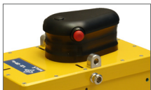
Several antenna options