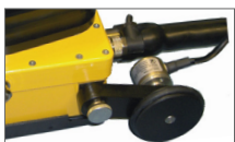
Several encoder options