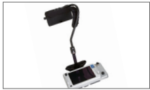
Optional shoulder harness