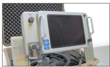
Adjustable viewing angle